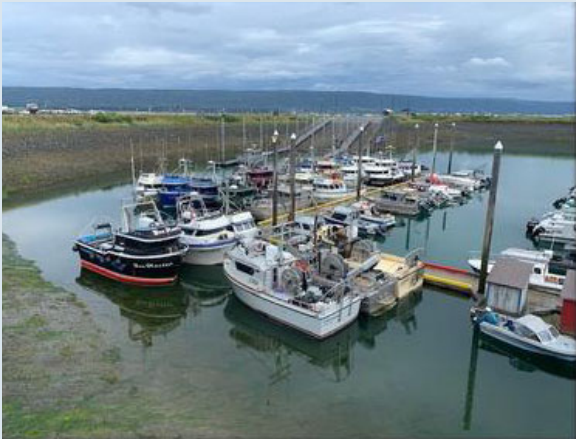
Overcrowding is a navigational hazard, increases maintenance and repair costs through over stressing the floats and costs the marine industry in time delays.