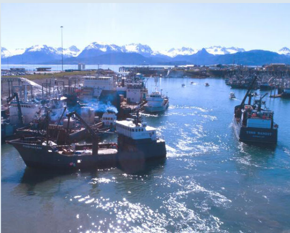
A Section 22 Navigational Improvement study completed in 2019 by the USACE and the City of Homer showed a preliminary Benefit Cost Ratio (BCR) of 0.9 to 1.0, confirming that the project meets national thresholds for Federal investment and that proceeding with a General Investigation Study (GI) is warranted. A GI will provide additional data for the BCR analysis and will consider design alternatives, which USACE predicts will increase the BCR beyond the range estimated in the PAS Report.