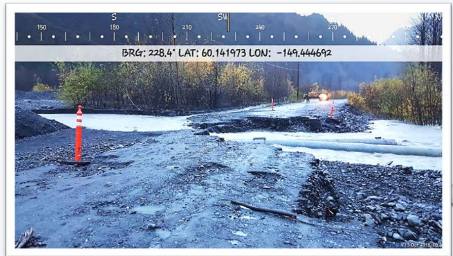
Japanese Creek overtops Dieckgraeff Road during the Oct. 2018 flood.