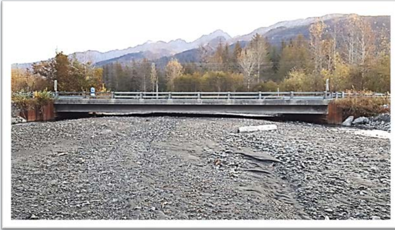
Sawmill Creek Nash Road bridge prior to maintenance.