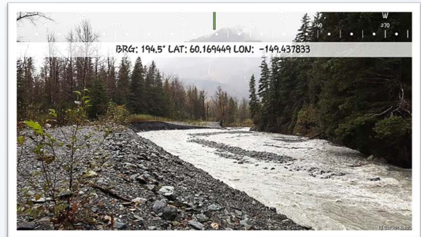
Box Canyon Creek gravel embankment protects the Old Exit Glacier neighborhood.