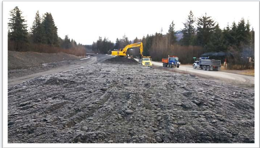
Kwechak Creek Sediment Management & Maintenance Project