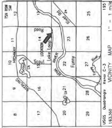
USGS Quadrangle Kenai, C-3 1:83,360 VICINITY MAP 1" = 1 mile