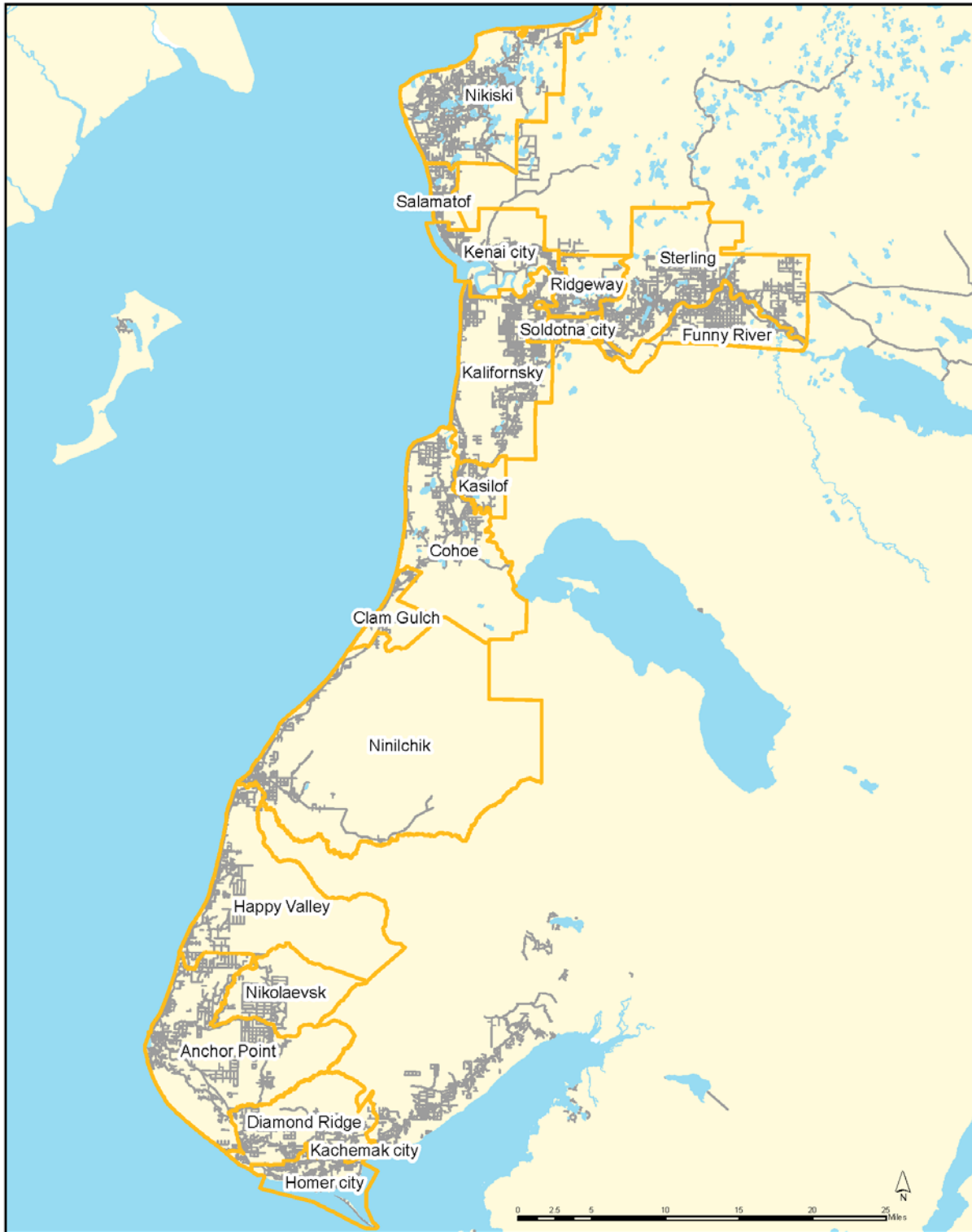
Census Designated and Incorporated Places within Central and Southern Kenai Peninsula