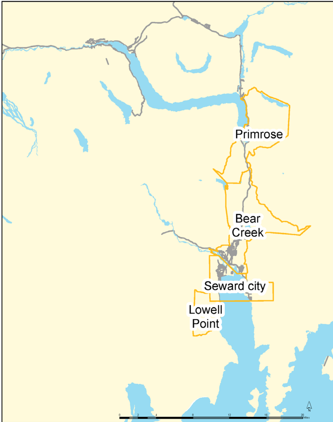
Census Designated and Incorporated Places in the Seward Vicinity