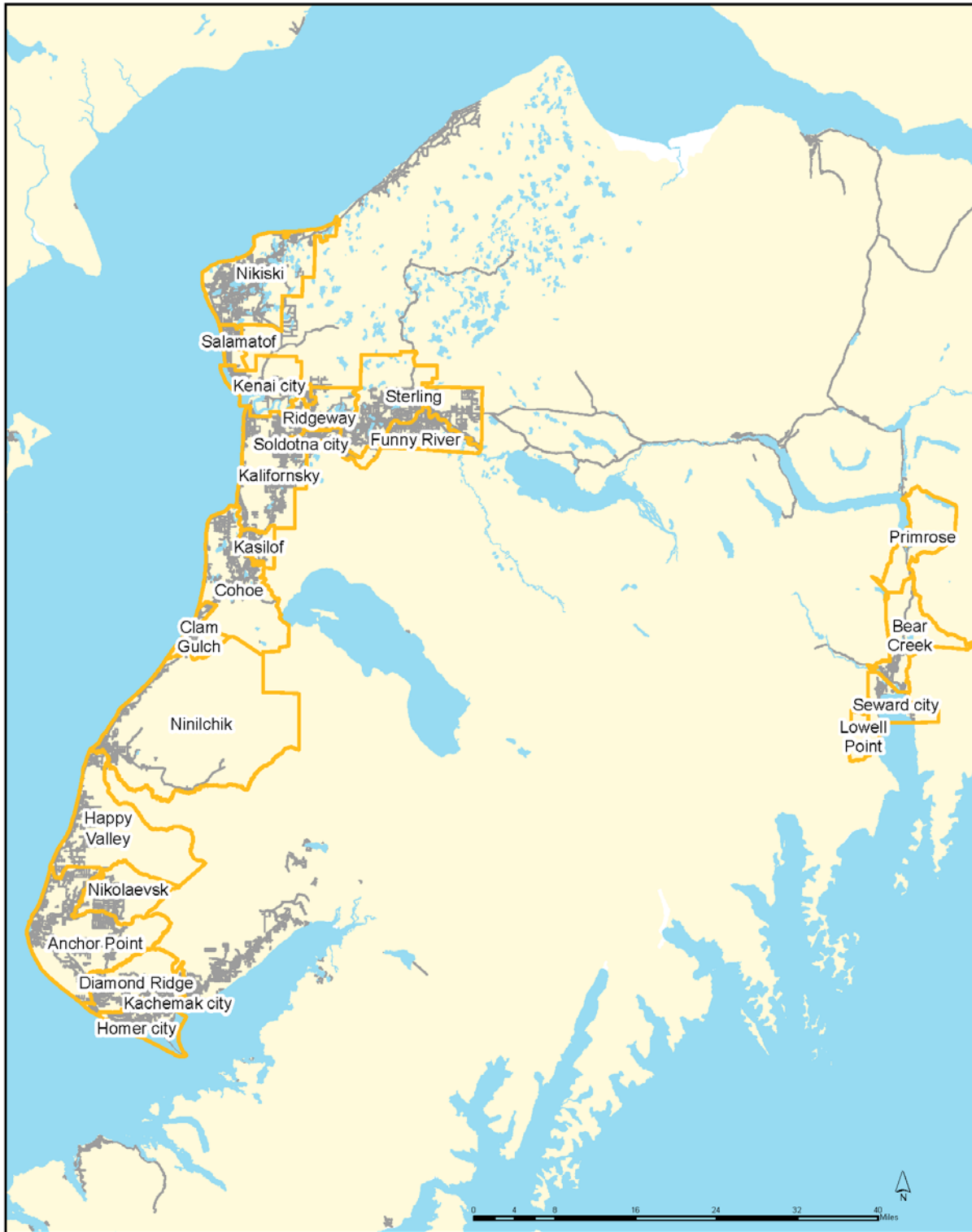
Selected Census Designated and Incorporated Places on the Kenai Peninsula