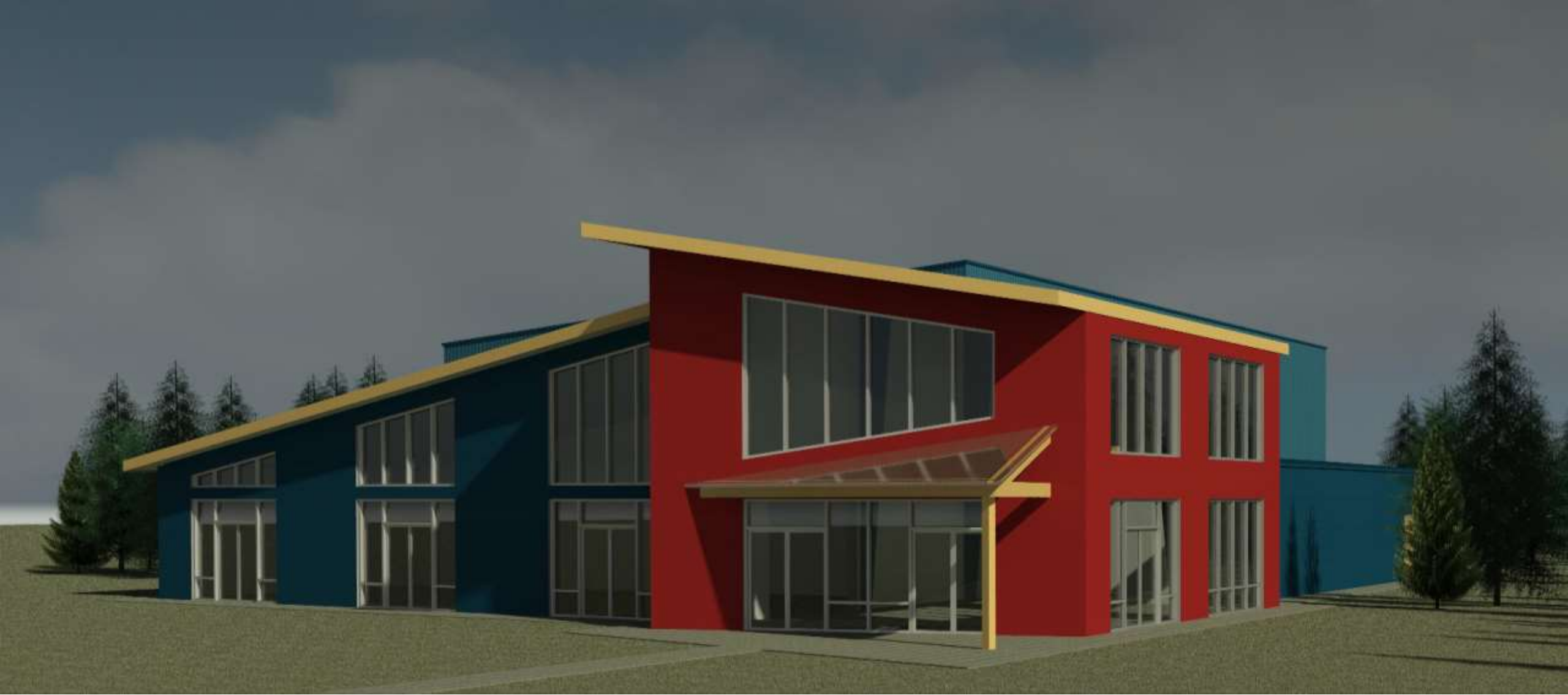
Alaska Christian College Community Gymnasium to be completed summer 2023