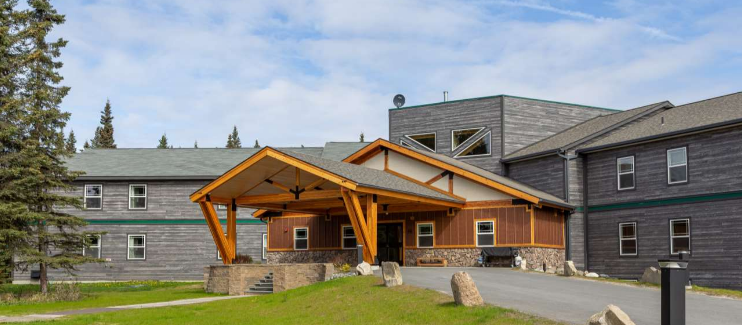
Peninsula Conference Center and 64-bed dormitory completed in 2018