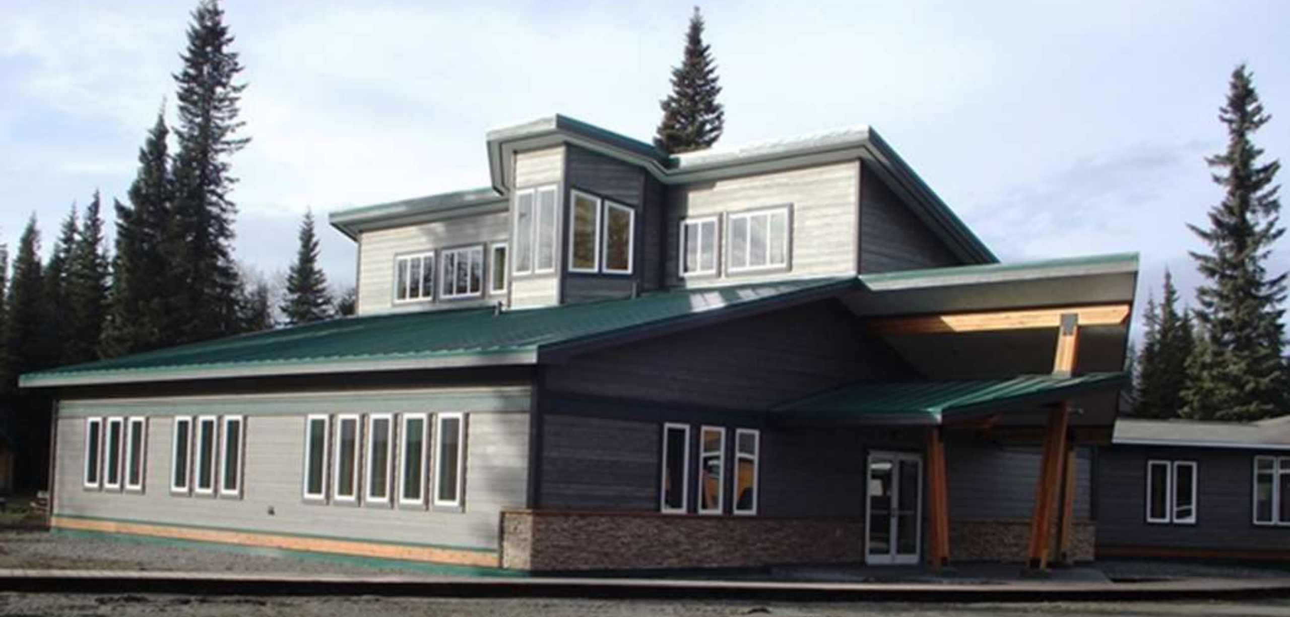
State of the art classroom building with science lab, computer lab and six classrooms