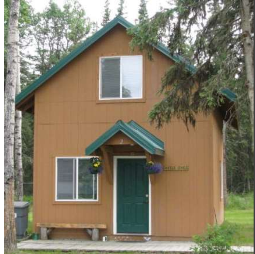
The Peninsula Conference Center at Alaska Christian College