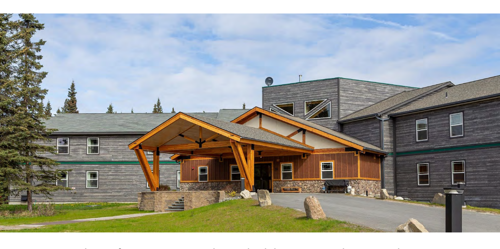
Peninsula Conference Center with a 72-bed dormitory and 150 seat dining room