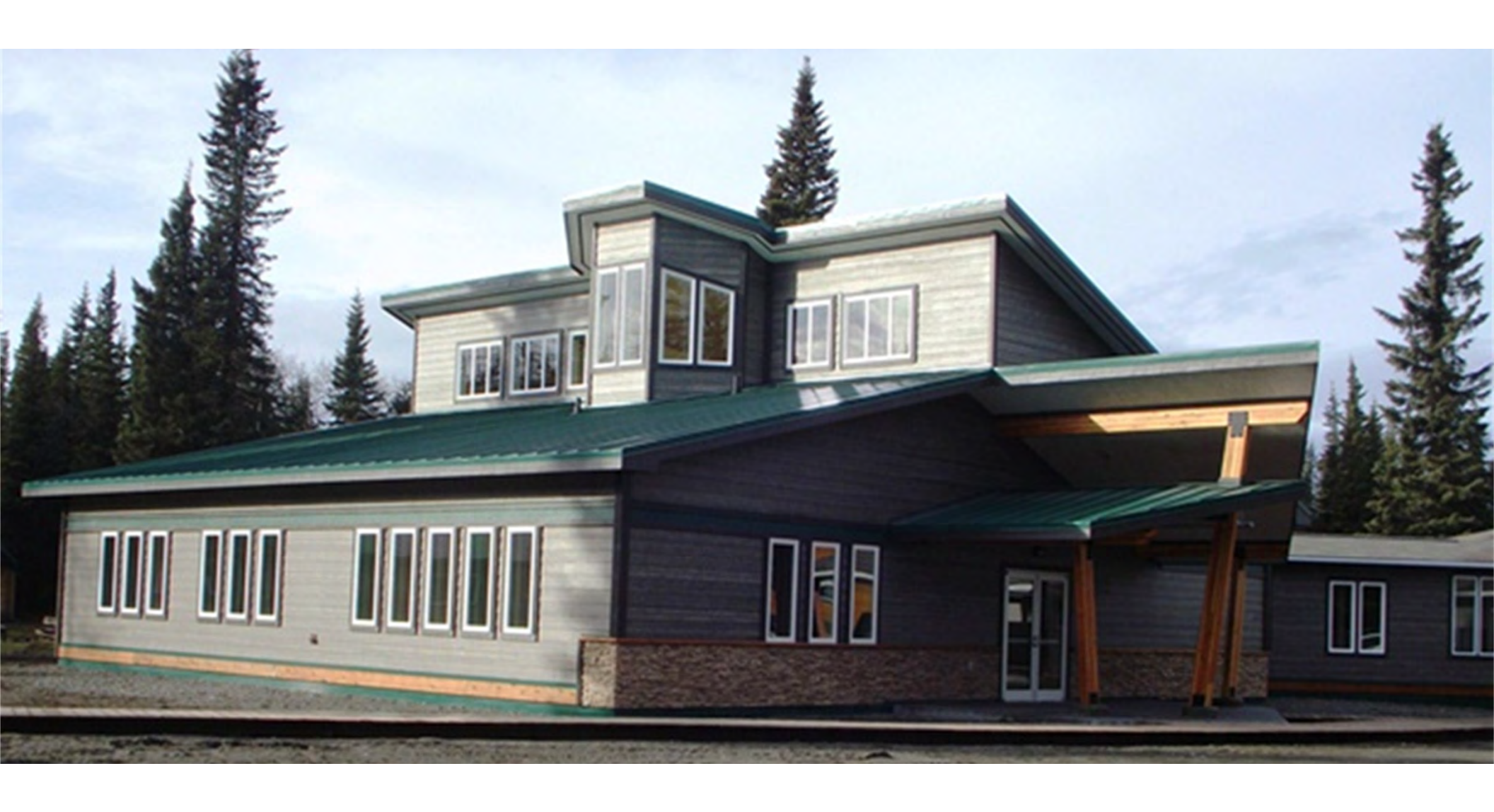
State of the art classroom building with science lab, computer lab and four classrooms