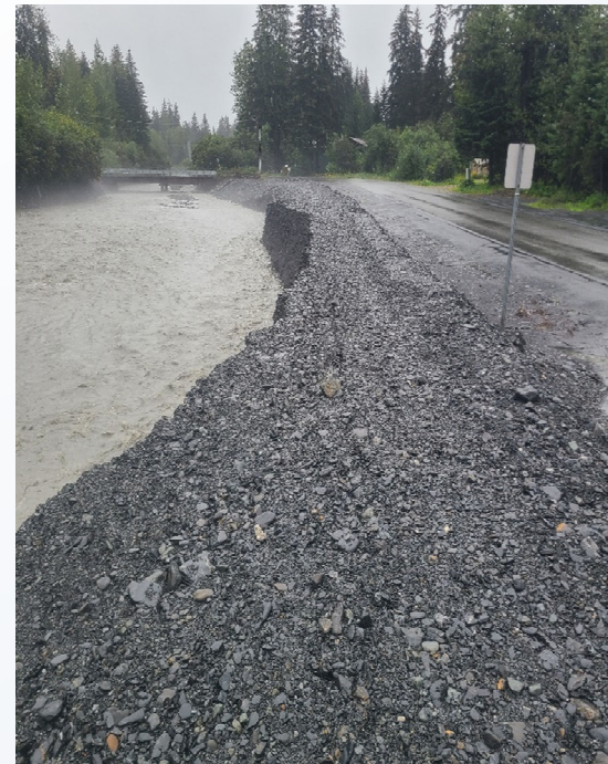
Kwechak Creek Bruno Road bridge during 2024 event.