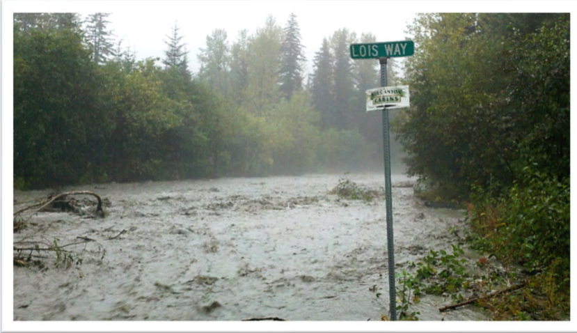
Old Exit Glacier Road during Box Canyon Creek embankment breach, 2012 event.