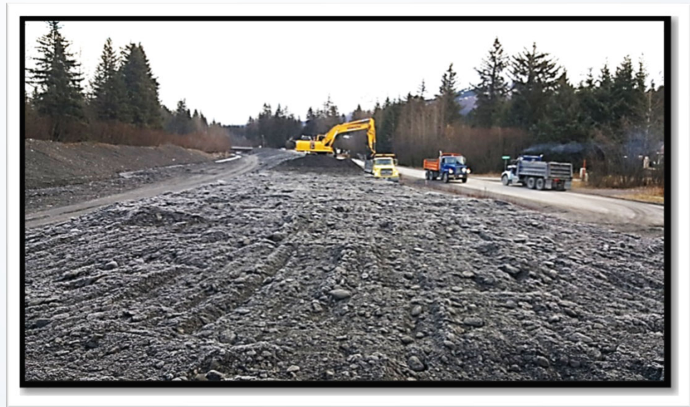
Kwechak Creek sediment management & maintenance project.