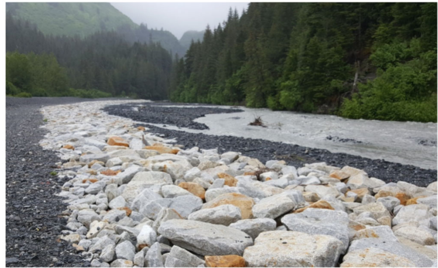
Salmon Creek revetment maintenance site.