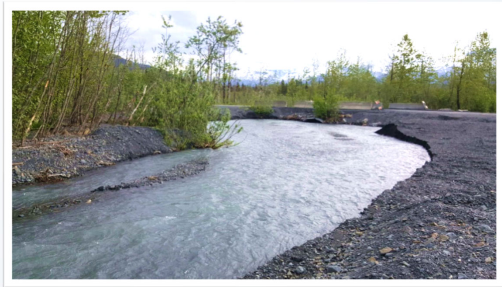
Japanese Creek main channel culverts on Dieckgraeff Road.