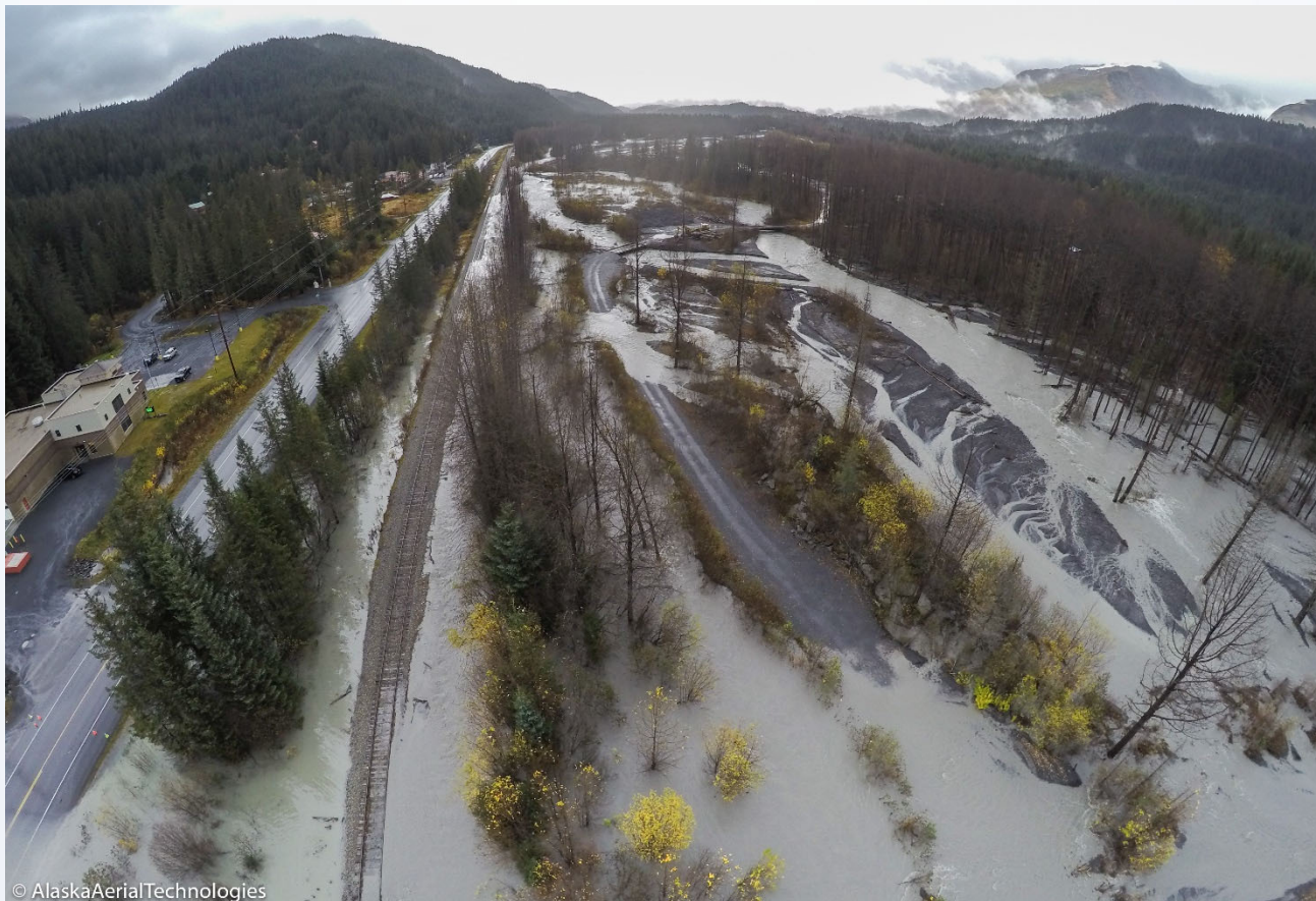
Salmon Creek overtops the Seward Hwy mile 5 during the October 2018 flood event.