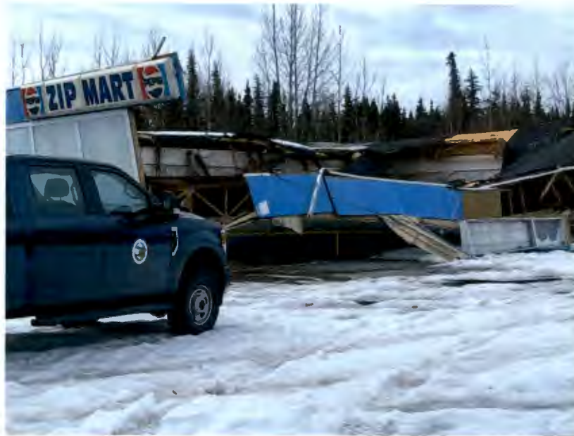
View facing Swanson River Road