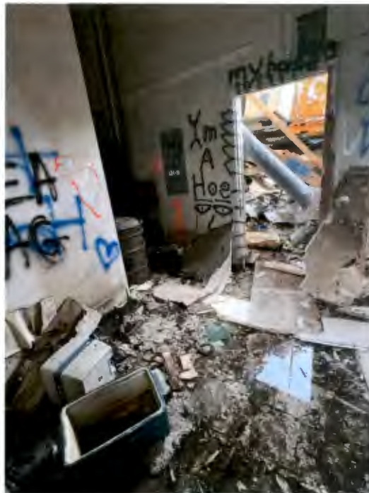
Rear entrance, still standing and nothing to block access