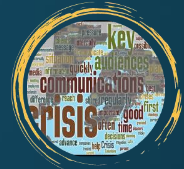
INCIDENT MANAGEMENT TEAM The Whole Package unsung heros from KPB staff to volunteer cadre