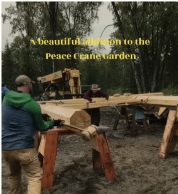
A beautiful addition to the Peace Crane Garden.