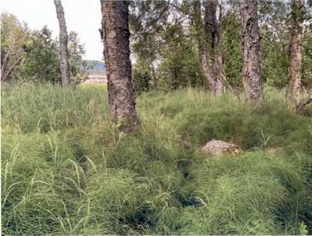
Flowing water and small ponds occur through out the parcels. This one shows a thick layer of peat.