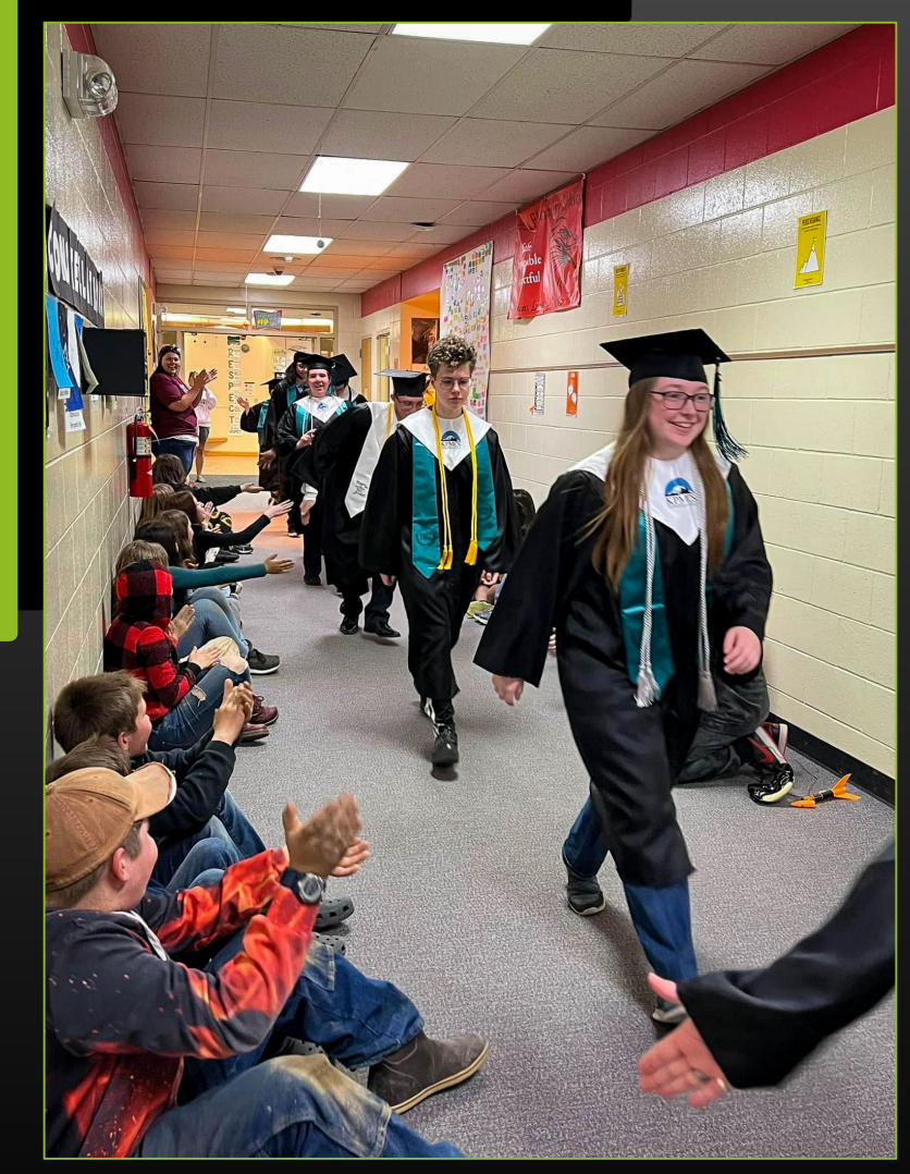
River City Academy Class of 2022 visit Sterling Elementary