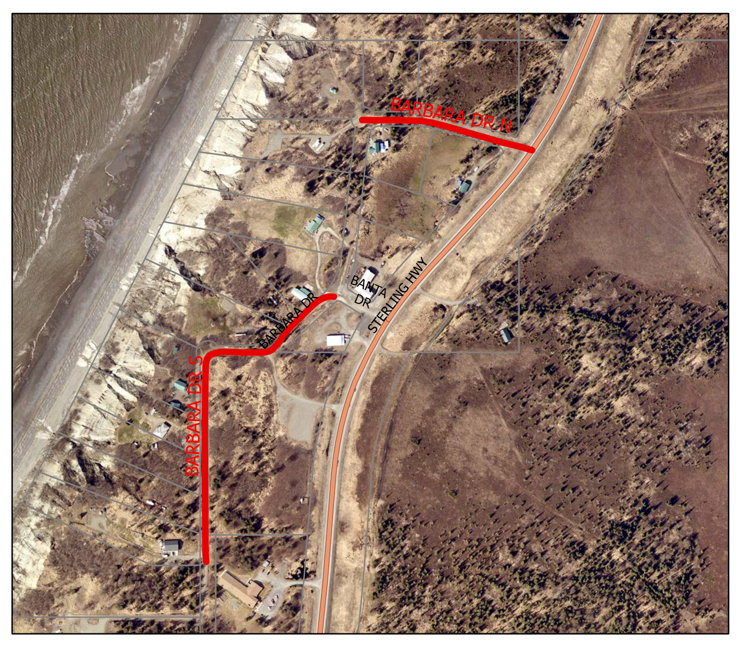
SN Resolution 2024-01 T01S-R14W Section 27 Ninilchik