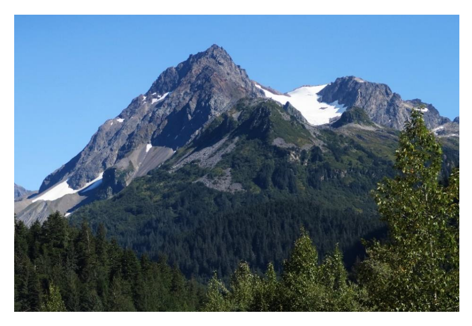
Mount Mary as viewed from the Fourth of July rock quarry.

Mount Mary (4883') is the main peak east of the ship lift/prison sites, lying on the southeast side of the Godwin Glacier, opposite and somewhat behind Mount Alice.