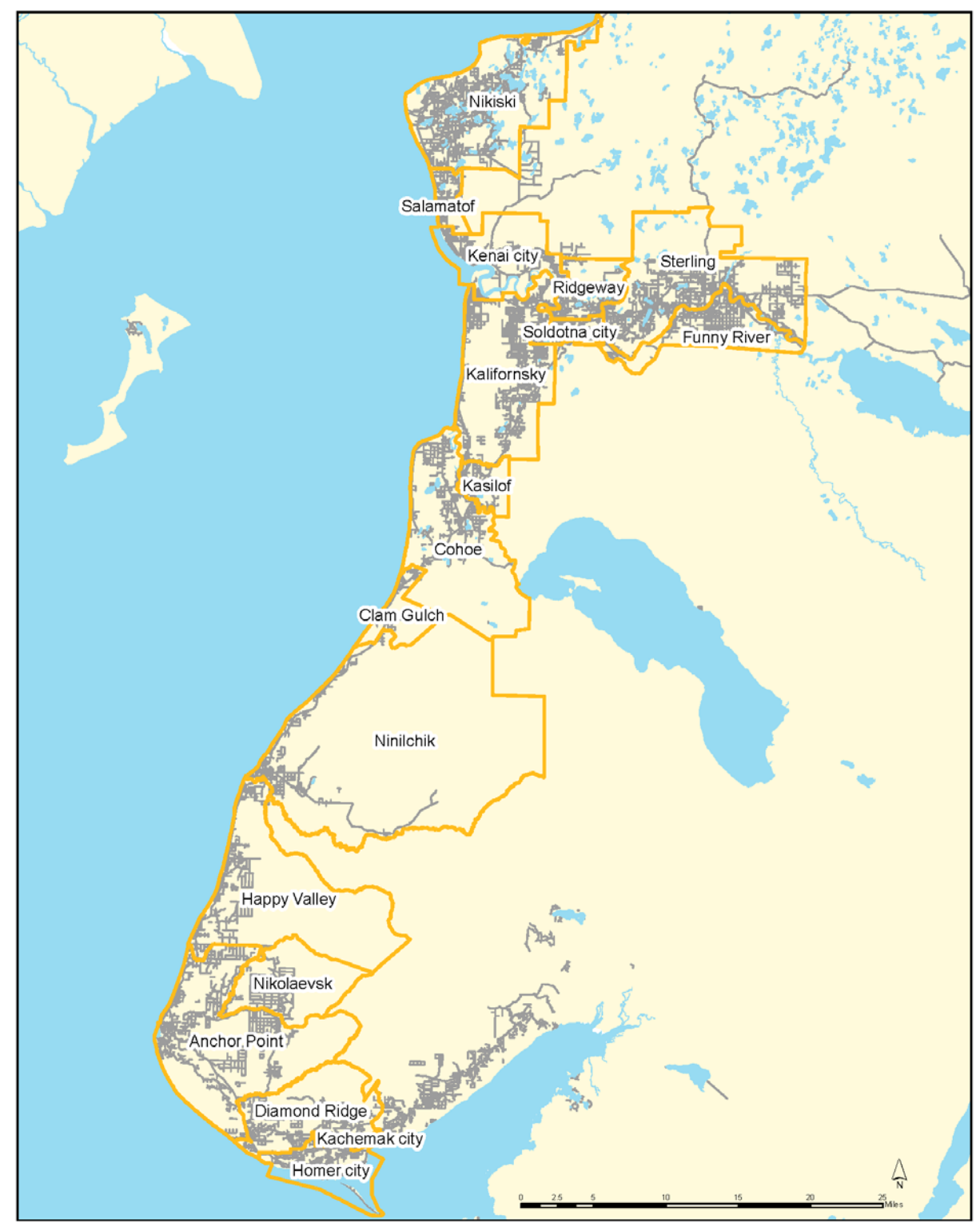
Map 2 Census Designated and Incorporated Places in the Central and Southern Kenai Peninsula Regions within the Kenai Peninsula Coordinated Public Transit-Human Services Transportation Plan