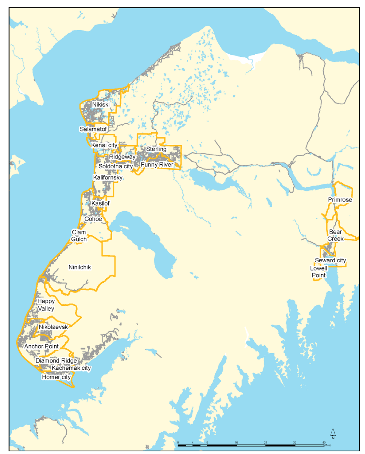
Map 1 All Census Designated and Incorporated Places within the Kenai Peninsula Coordinated Public Transit-Human Services Transportation Plan