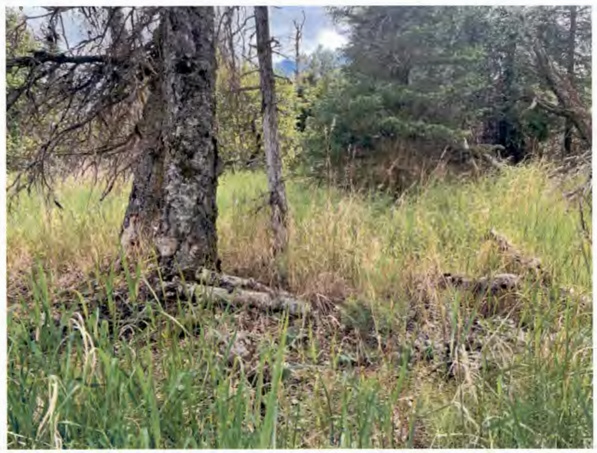
This is one of many spots where moose have recently bedded down. There is winter browse, summer vegetation and lots of cover and fresh water for not only moose but birds, bear and lynx.