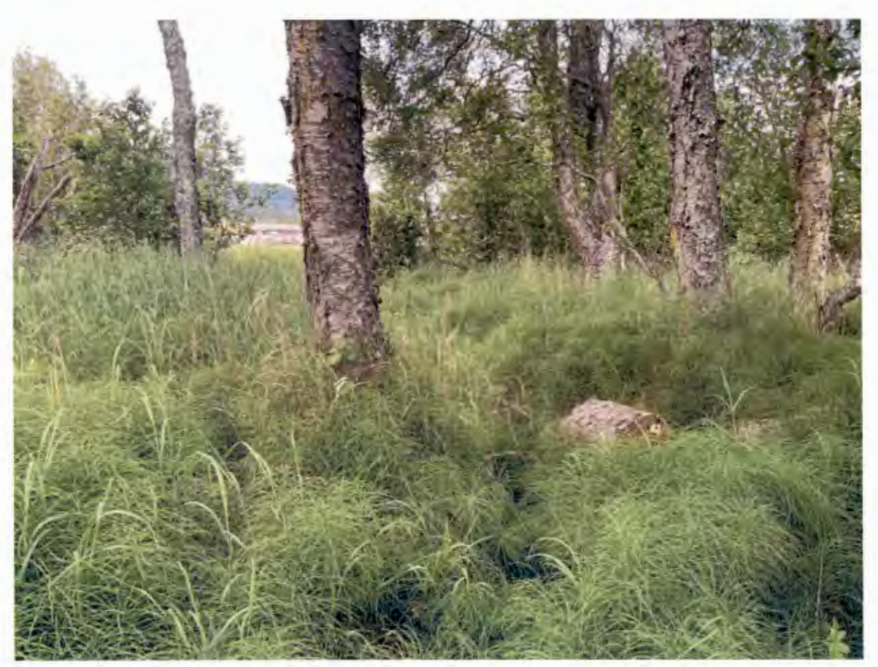
Flowing water and small ponds occur through out the parcels. This one shows a thick layer of peat.