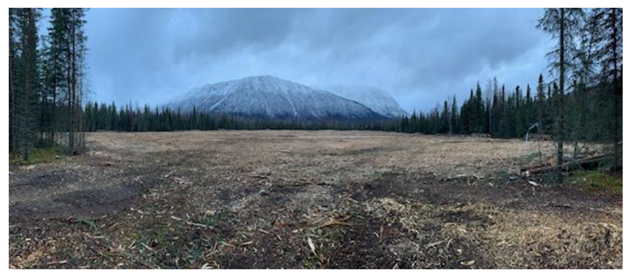
Figure 1 - Site Photo 11/20/2020

Under existing KPB Land Use Permit LMD 20-17, KIWC has completed 10.8 Acres of timber clearing and salvage; and soil sampling at Tract C during the week of November 16<sup>th</sup>, 2020. The current condition of the parcel is shown in the photo below.