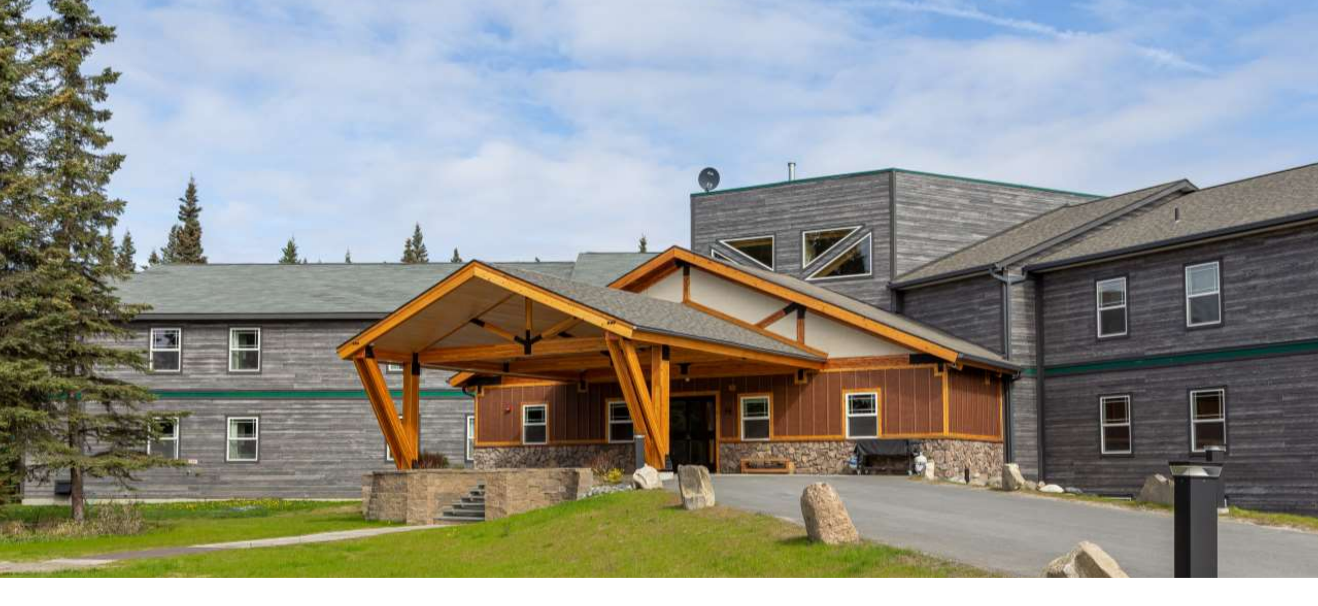
Peninsula Conference Center and 64-bed dormitory completed in 2018