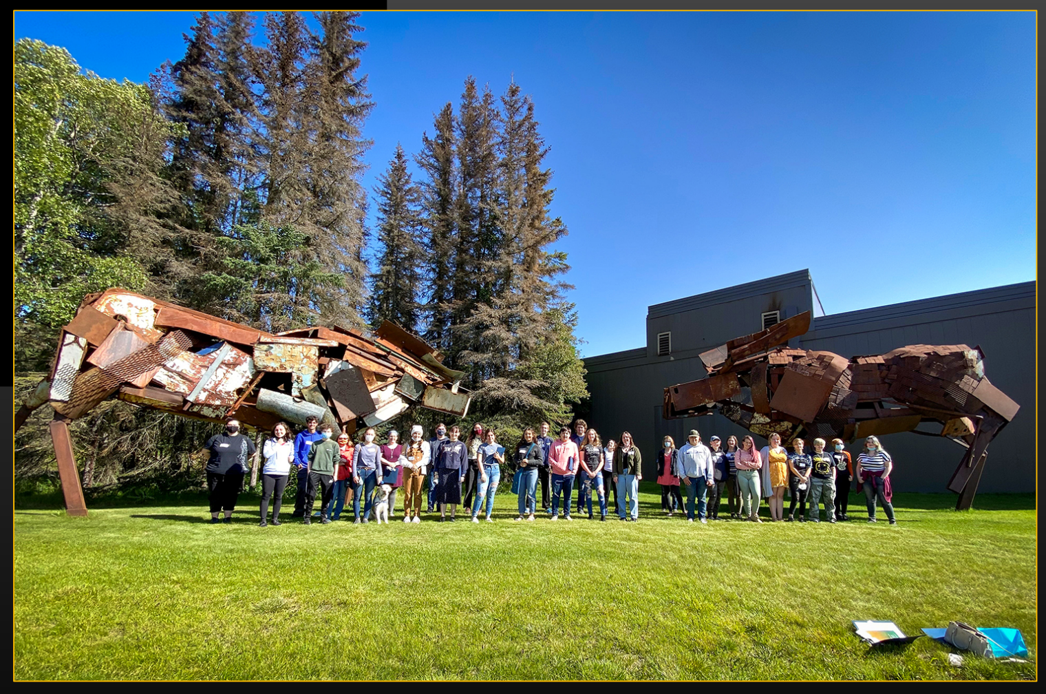
Year Two: 35 students enroll in fall semester, with capacity for an additional 15 students to enroll in January 2022!