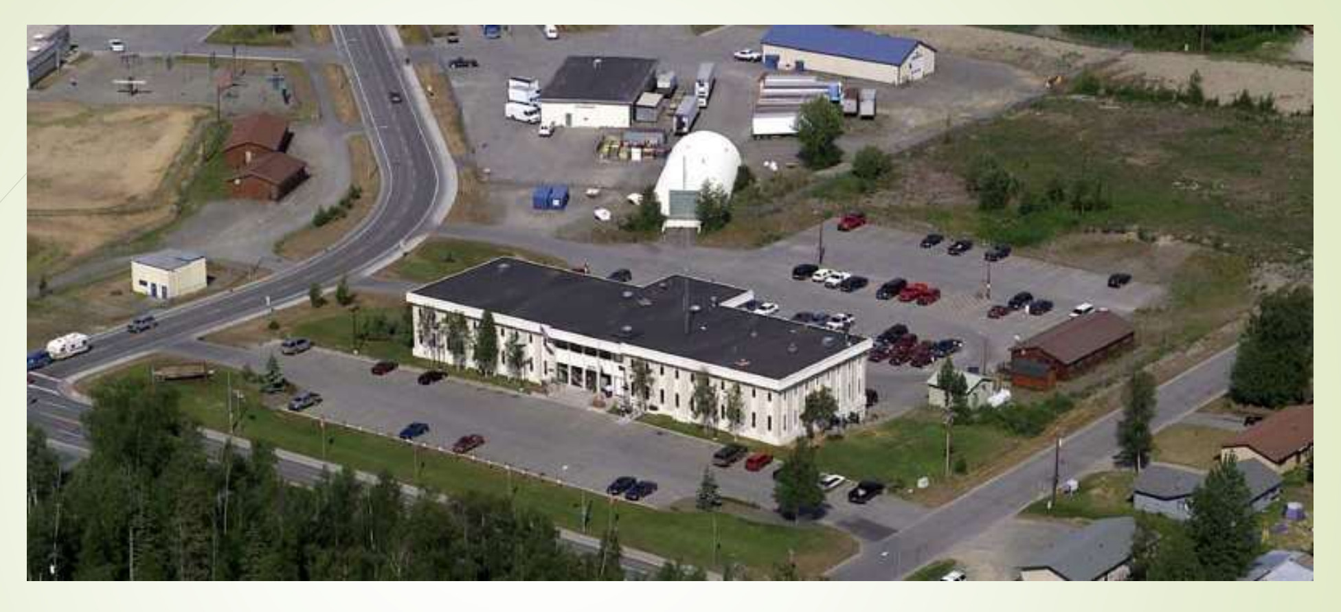
Borough Administrative Building – one example of borough lands.